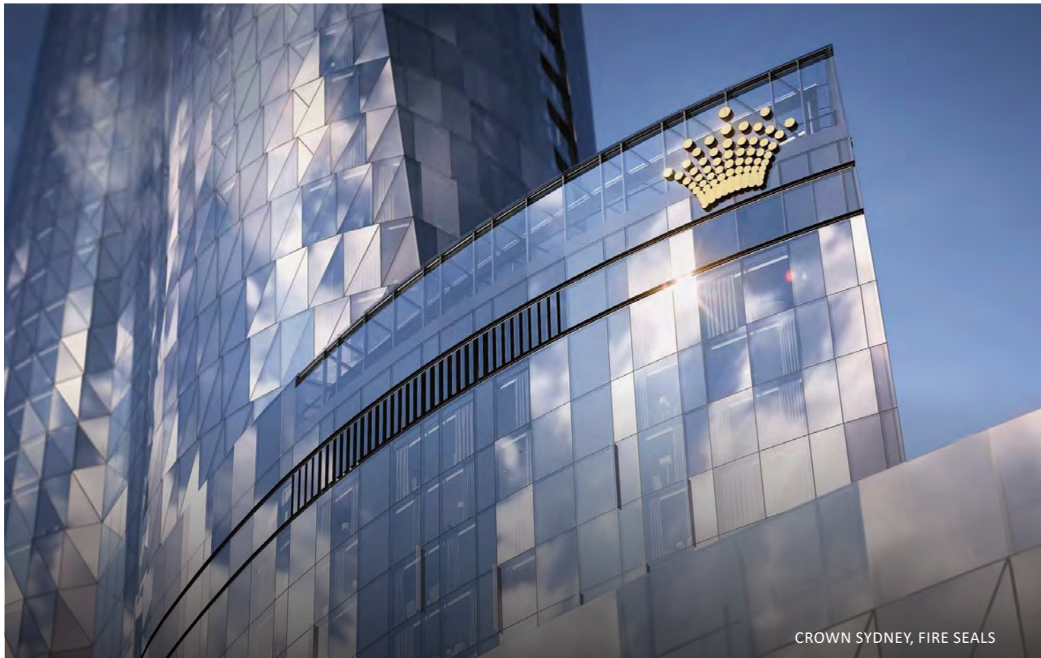
CROWN SYDNEY, FIRE SEALS