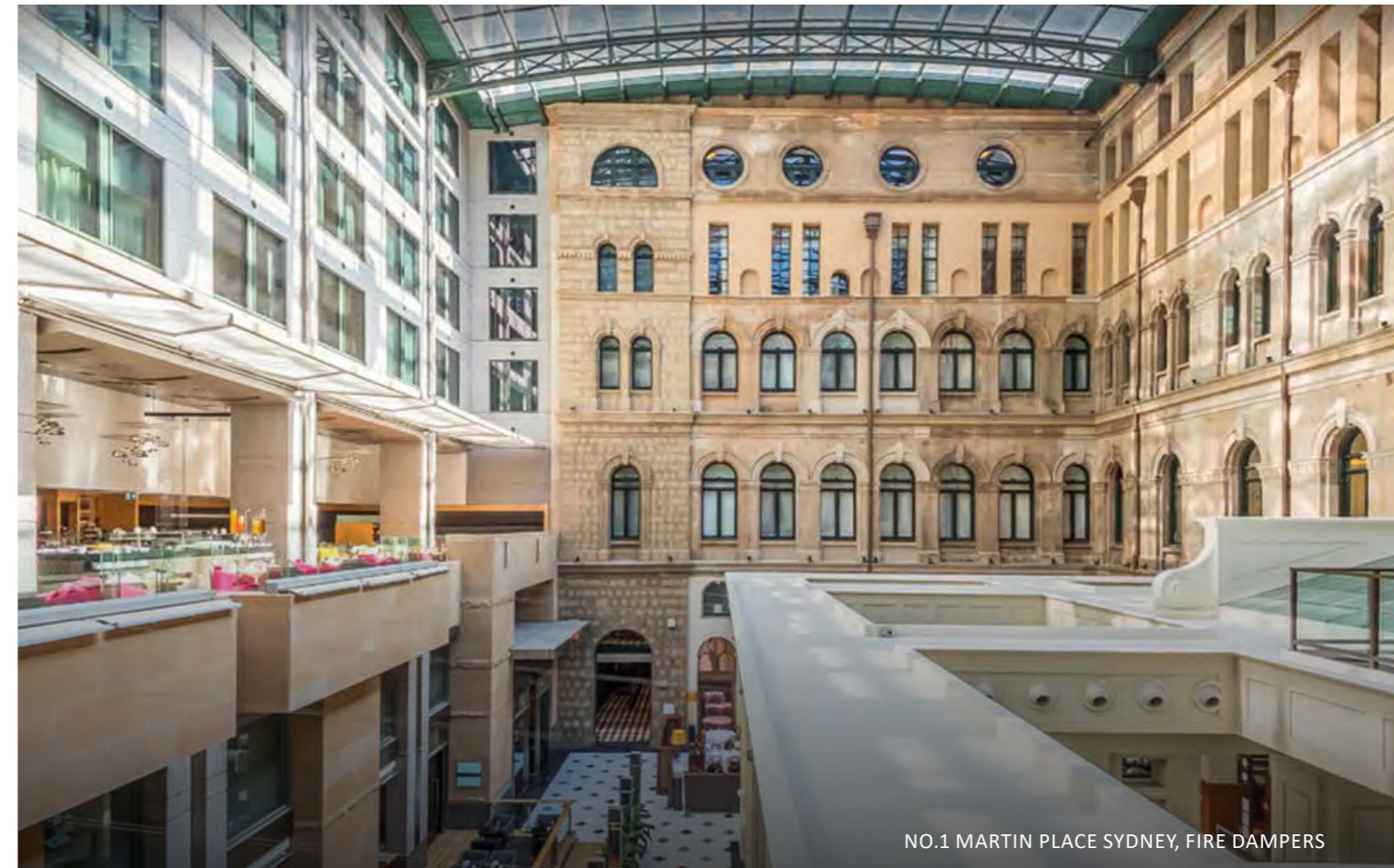
NO.1 MARTIN PLACE SYDNEY, FIRE DAMPERS

As a result of the exceptional workmanship and service Bowers demonstrated during this project, Star Electrical (Crown Casino's electrical maintenance provider) appointed Bowers to provide ongoing Passive Fire Protection services to Crown Casino.