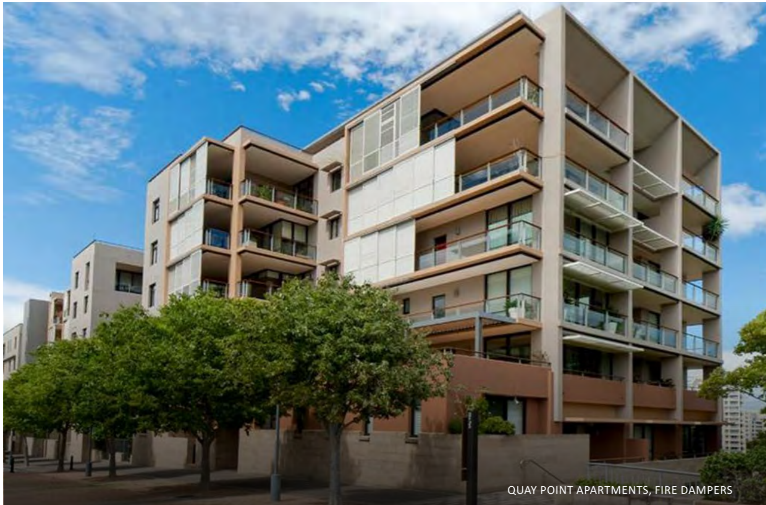
QUAY POINT APARTMENTS, FIRE DAMPERS