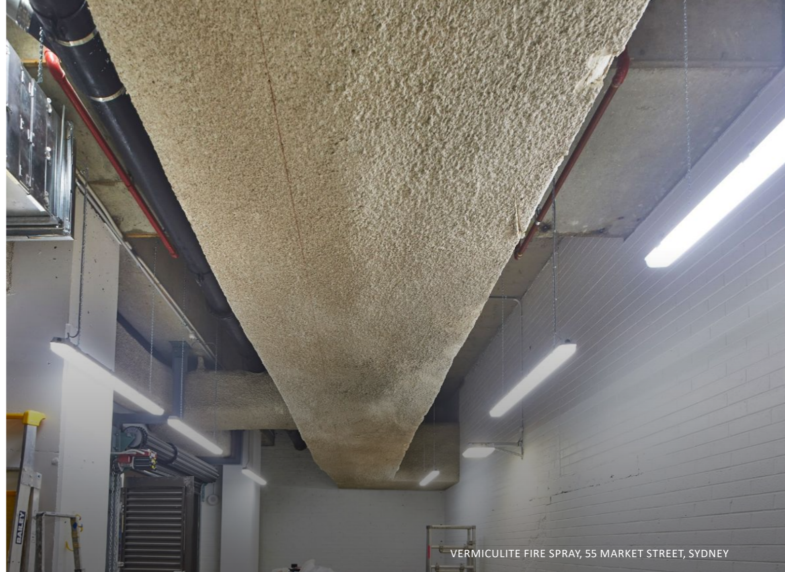
VERMICULITE FIRE SPRAY, 55 MARKET STREET, SYDNEY