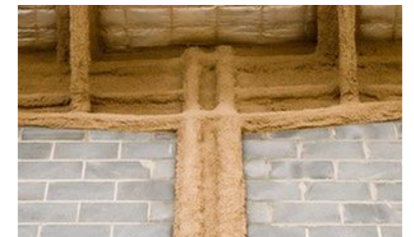
VERMICULITE FIRE SPRAY APPLICATION