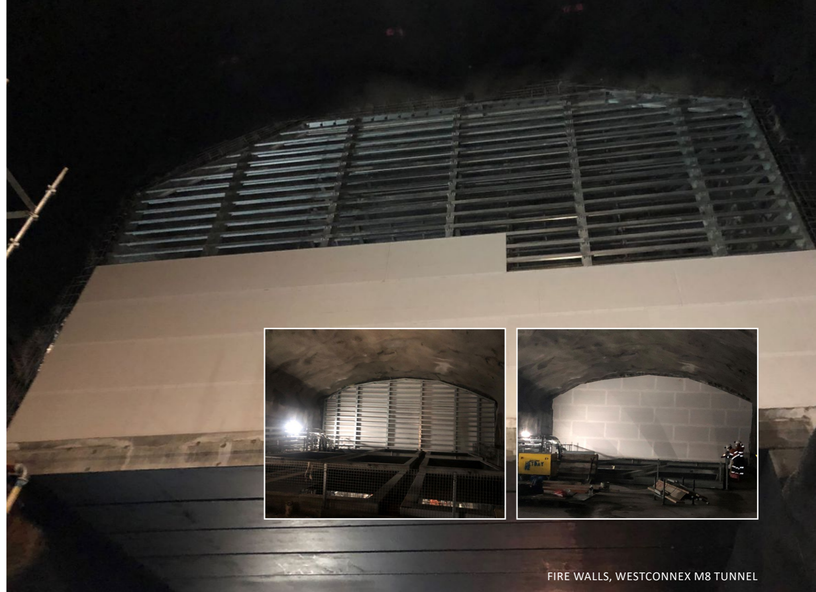
FIRE WALLS, WESTCONNEX M8 TUNNEL