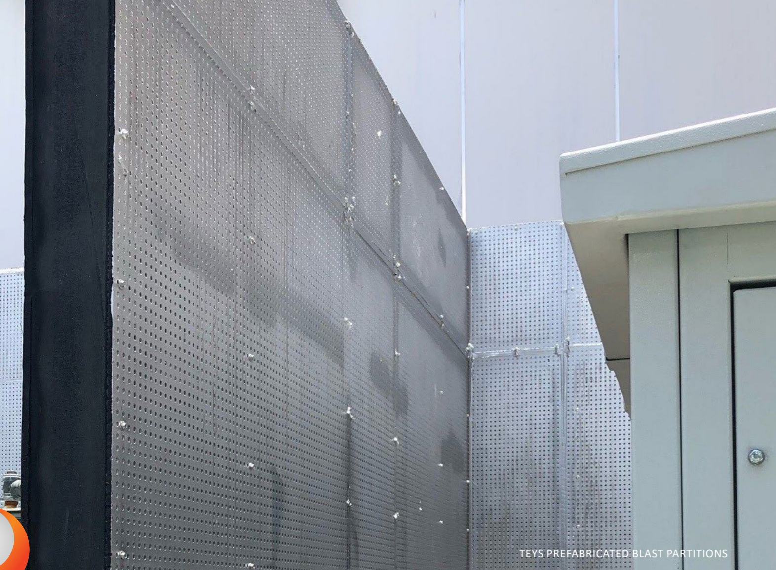
TEYS PREFABRICATED BLAST PARTITIONS