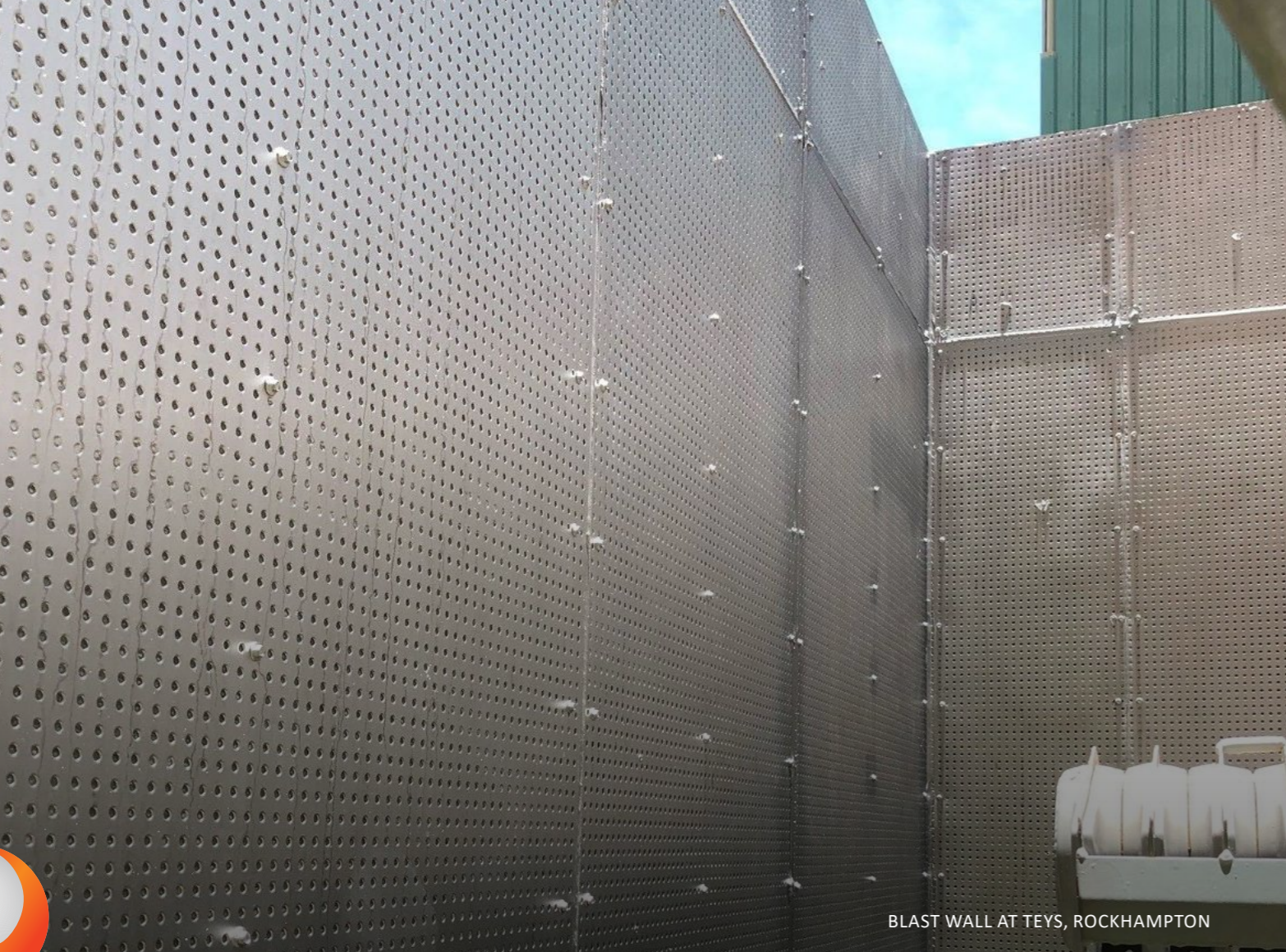
BLAST WALL AT TEYS, ROCKHAMPTON