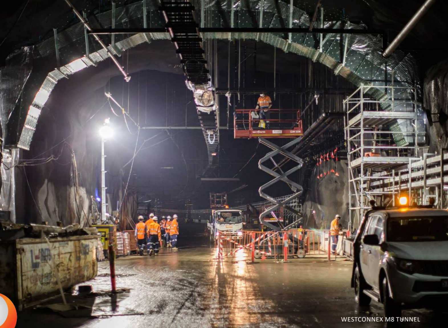
WESTCONNEX M8 TUNNEL