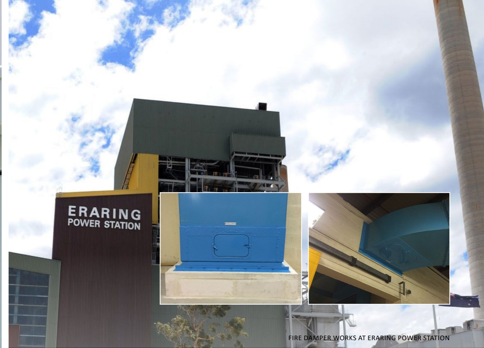
FIRE DAMPER WORKS AT ERARING POWER STATION

Bowers worked closely with a local steel fabricator and crane operator to prefabricate all partition framing and bracing. This enabled finished frames to be craned safely into position and firmly anchored in place. This construction approach effectively halved the amount of time installing on site and the associated power outages / isolations required. Given the Queensland location, Bowers needed to source and coordinate local suppliers and contractors. Pre-operation site inspections and pre planning with the client, multiple contractors, and suppliers was critical to project success. The project was completed 2 days ahead of schedule and the quality finish Bowers provided, exceeded client expectations.