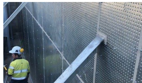
DURASTEEL® INSTALLATION, BILOELA