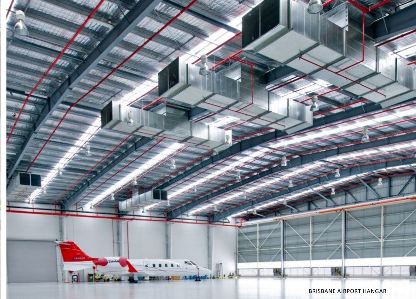
BRISBANE AIRPORT HANGAR