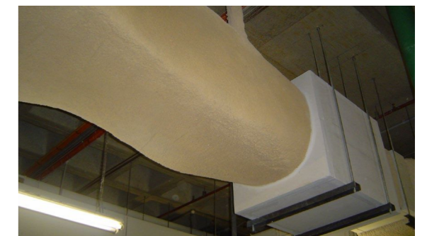
VERMICULITE FIRE SPRAY APPLICATION