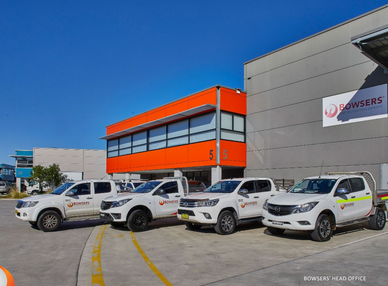
BOWSERS' HEAD OFFICE