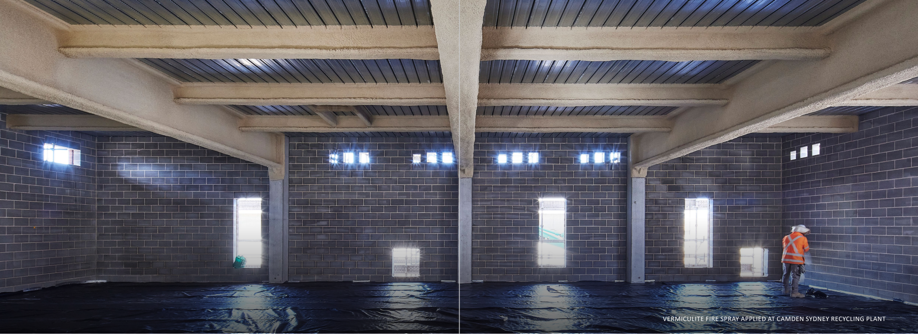
VERMICULITE FIRE SPRAY APPLIED AT CAMDEN SYDNEY RECYCLING PLANT