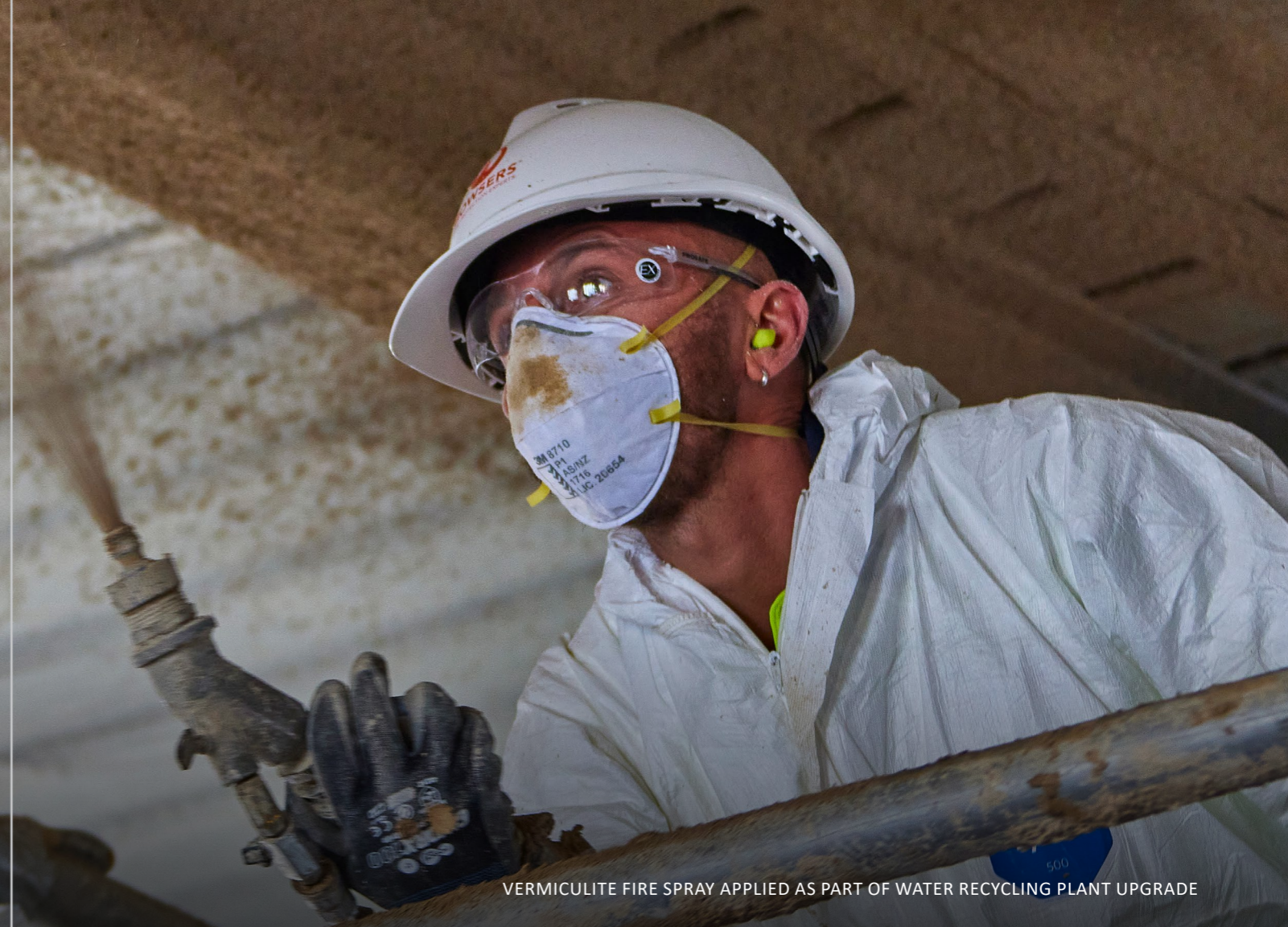
VERMICULITE FIRE SPRAY APPLIED AS PART OF WATER RECYCLING PLANT UPGRADE