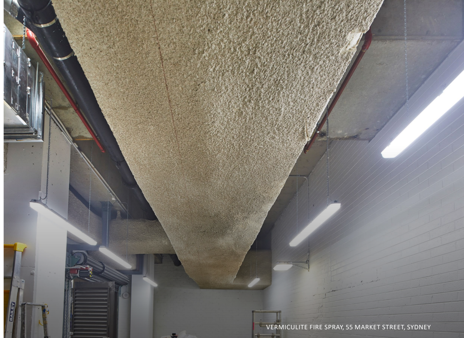
VERMICULITE FIRE SPRAY, 55 MARKET STREET, SYDNEY