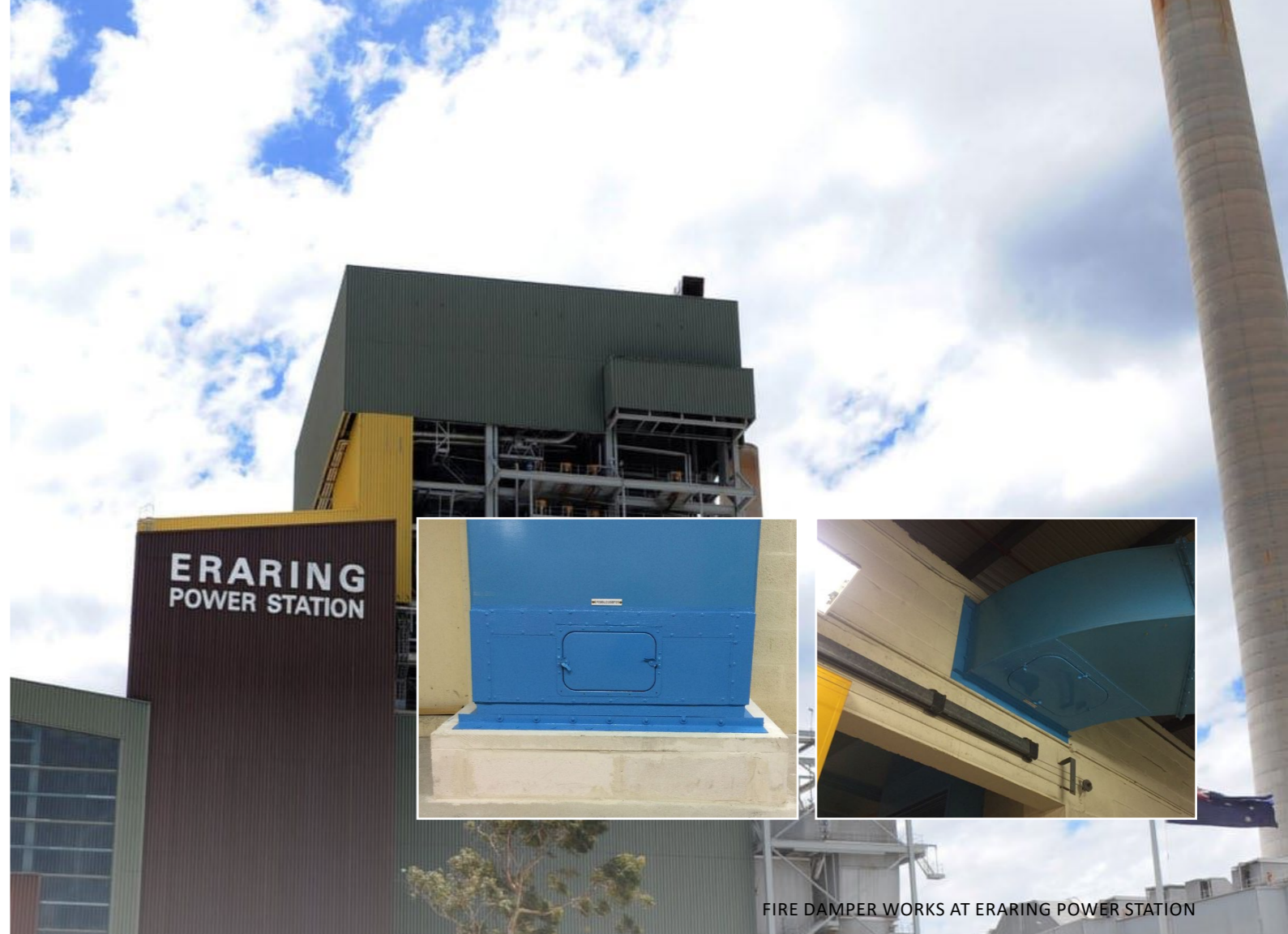
FIRE DAMPER WORKS AT ERARING POWER STATION

Bowers worked closely with a local steel fabricator and crane operator to prefabricate all partition framing and bracing. This enabled finished frames to be craned safely into position and firmly anchored in place. This construction approach effectively halved the amount of time installing on site and the associated power outages / isolations required. Given the Queensland location, Bowers needed to source and coordinate local suppliers and contractors. Pre-operation site inspections and pre planning with the client, multiple contractors, and suppliers was critical to project success. The project was completed 2 days ahead of schedule and the quality finish Bowers provided, exceeded client expectations.