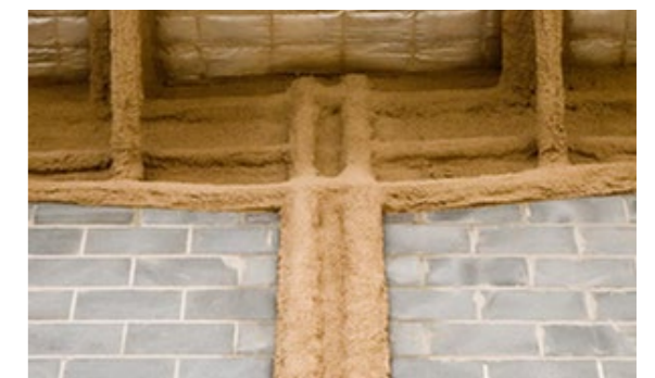
VERMICULITE FIRE SPRAY APPLICATION